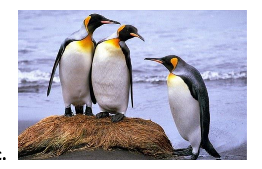
From 3. Take away